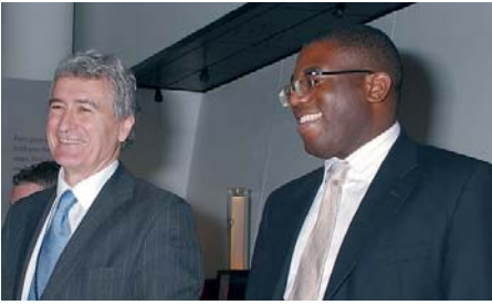
David Lammy MP, Minister of Culture, on his first ministerial visit

“The British Library plays an important role in the national economy through its support for UK research excellence and innovation, in addition to the major contribution it makes to the social and cultural enrichment of Britain’s citizens.”