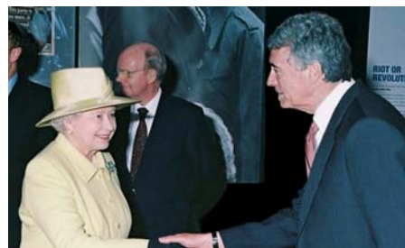
Her Majesty The Queen visiting the Library to open the Front Page exhibition

The British Library has a unique perspective to bring to the public debate on Copyright and Intellectual Property that was initiated during the year. This perspective derives from its position at the fulcrum of the balance of interests of rights holders and rights users. We submitted evidence to the House of Commons Culture, Media and Sport inquiry into New Media and the Creative Industries, to the All Party Parliamentary Internet Group inquiry into Digital Rights Management (DRM), and to the Gowers Review of Intellectual Property. The Library is continuing to play a high level advocacy role in this debate which is of critical significance for research, scholarship and innovation and for the creative economy of the UK. The Library recognises that there is a need to modernise copyright legislation for the digital age.