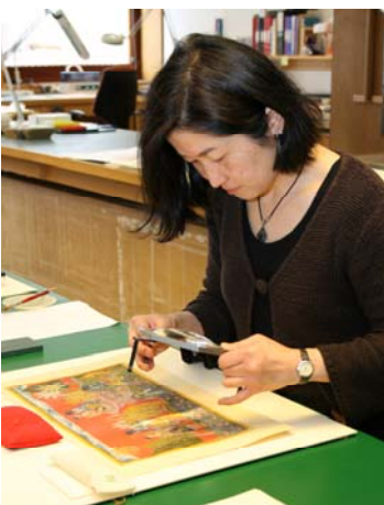
Above: A conservator working on an illustration from one of the Ramayana volumes

removing the Ramayana from the bindings and mounting the individual sheets of paper in double sided conservation mounts, allowing access to both text and paintings on either side of the paper. As part of this process tears are repaired and flaking pigment consolidated to stabilise the paintings. In time the full Ramayana will be mounted and stored in archival boxes.