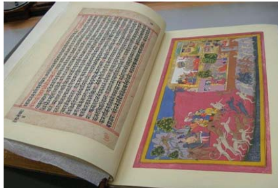
Above: The text and painted illustrations inlaid into sheets of modern western paper making up the textblock

The work in preparation for the exhibition of the Ramayana is part of an ongoing conservation treatment which involves